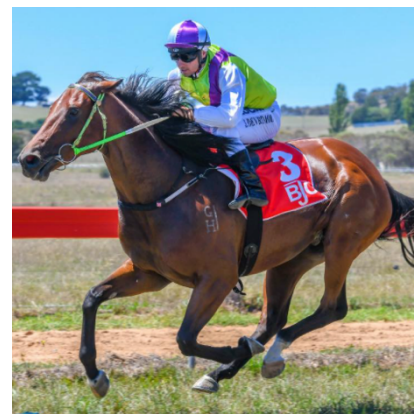
Joe Cleary Racing

PC 331. Supreme Pony Club Rider (classes PC 314 & PC 330 eligible)